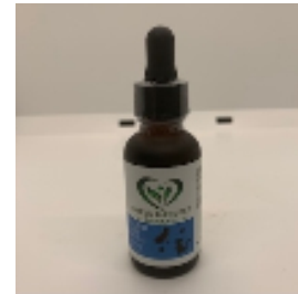
Cannabinoids (% weight)